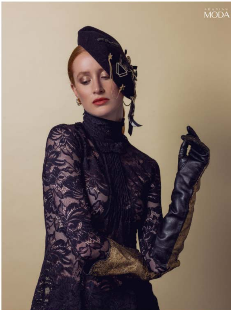
Ines black wool beret with gold chains and pins, Lauthère , Alicnor golden metal flowers and crystal beads earrings, Philippe Ferrandis , Napoli gold and black gloves in flake and lambskin, Thomasine Gloves , High-neck floral lace blouse, Paco Rabanne (MATCHESFASHION) .