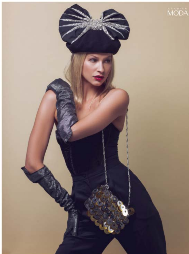
Any black wool beret with silver sequin bowtie, Lauthère , Salzburg metallic silver and black gloves in flake and lambskin, Thomasine Gloves , Sparkle 1969 mini sequined cross-body bag, Paco Rabanne (MATCHESFASHION) , Fargo black jacquard corset, Vivienne Westwood (MATCHESFASHION) , Black wool shorts, Manuri .