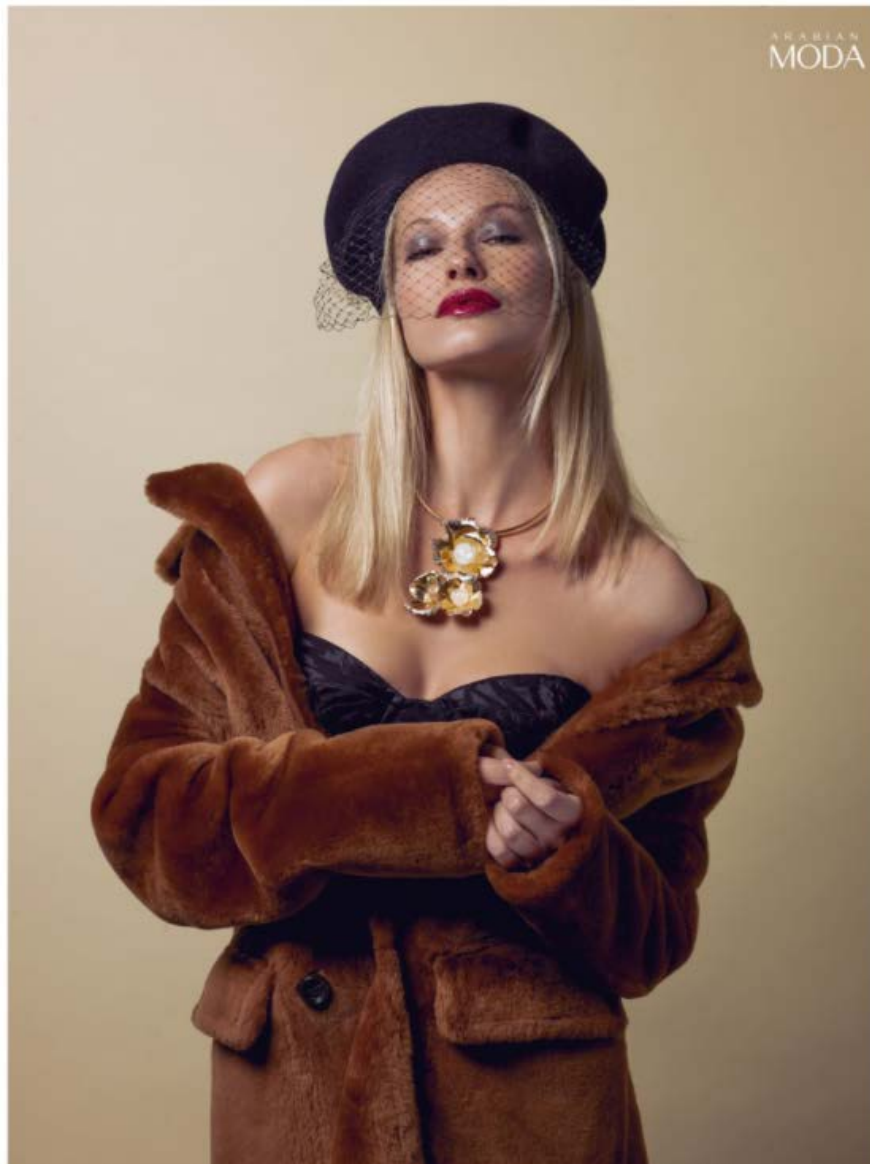
Grace black cashmere beret with net veil, Laudhère . Alténor golden metal flowers and crystal beads necklace, Philippe Ferrandis . Fargo black jacquard corset, Vivienne Westwood (MATCHES FASHION) . Brown shearling coat, Yves Salomon .