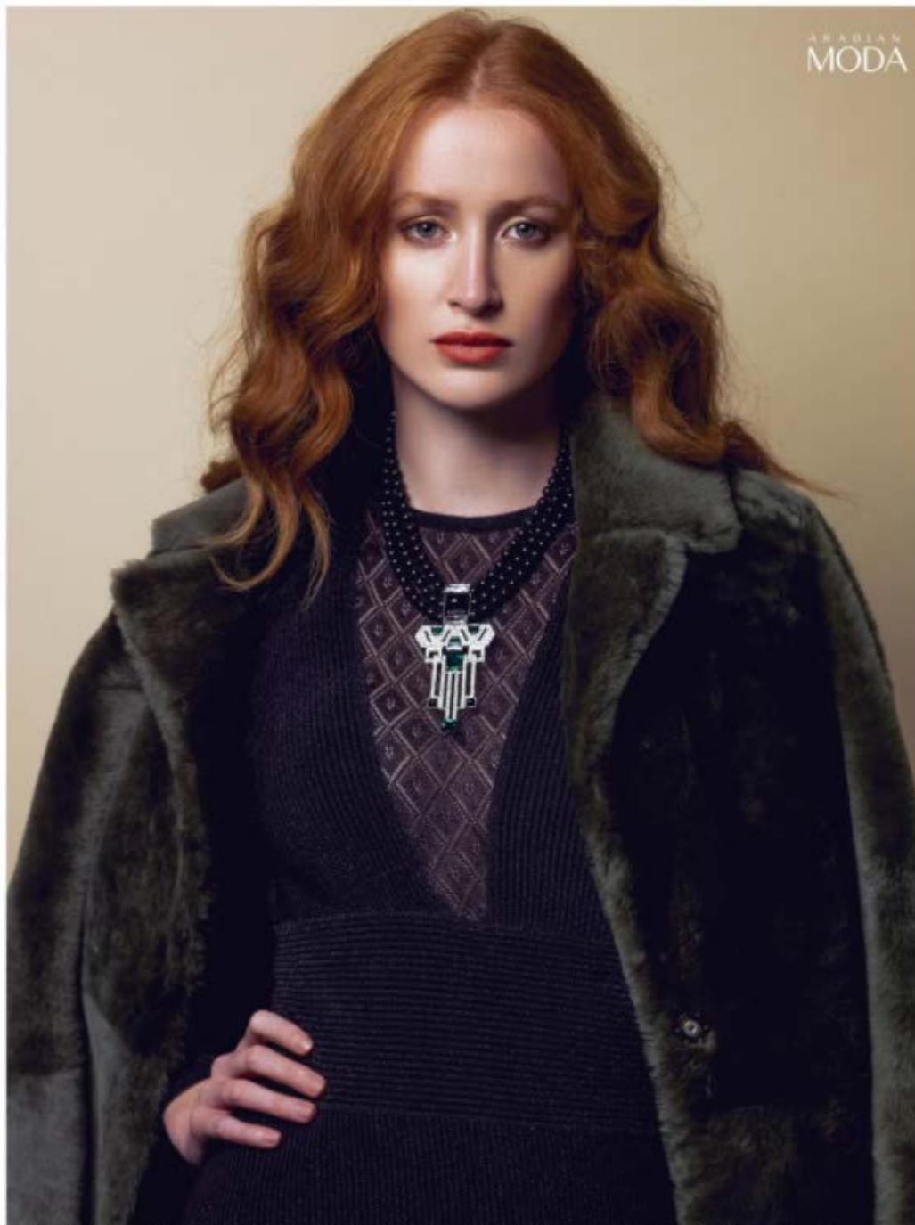
Maharani Art Deco black crystal pearls and rhodium plated necklace, Philippe Ferrandis . Black knitted with V-neck lace dress, Emanuel Ungaro . Green shearling coat, Yves Salomon .